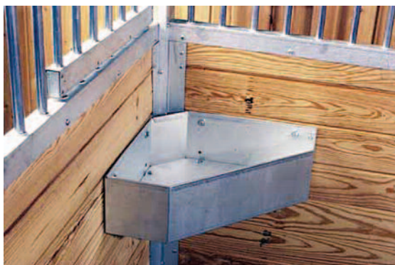
#60 Corner Feeder