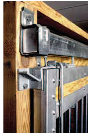
Top Mount Latching System