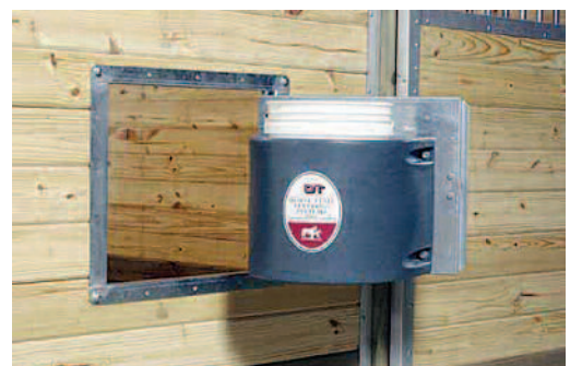
Swing-out Water Bucket System