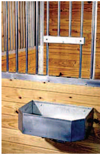
#50 Feed Bar with Wall Feeder